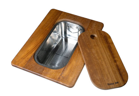
Iroko-wood sliding chopping board with stainless steel colander 8644 044

Graters kit with ring-holder and food collection tray