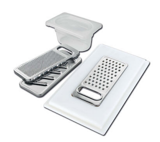
8159 101 * only in combination with the accessory 8644 101

Graters kit with ring-holder and food collection tray