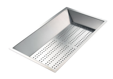
8151 000 * only in combination with the accessory 8644 101